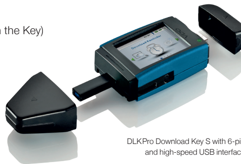
DLKPro Download Key S with 6-pin and high-speed USB interface

Order no. for DLKPro Neoprene Case: A2C59514917