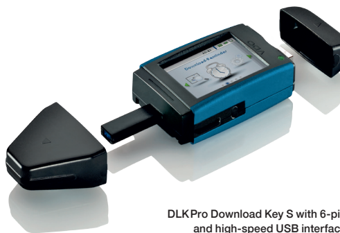
DLKPro Download Key S with 6-pin and high-speed USB interface